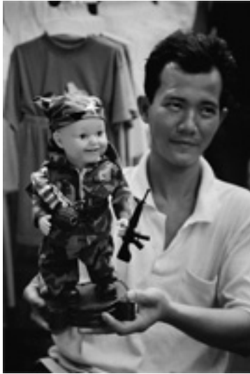
American visitors to Vietnam are always surprised by the lack of animosity towards them. This salesman is demonstrating a dancing, smiling GI Joe complete with M16 rifle and hand grenade.