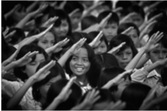
School children near Ho Chi Minh City during festivities to celebrate the end of the war.