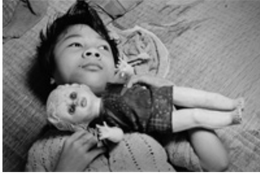
stationed near Cam Nghia, his native village.