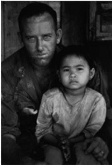
Older soldiers often missed their families and so befriended children and dogs. The canines proved more congenial ? more dogs than wives were taken back to America.