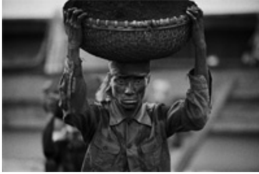
day labourers carry baskets of fine coal on their heads.