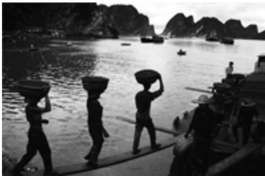
Hongai, just a few miles from the tourist destination of Halong Bay, is a major coal shipment point. This made it a target so US bombers obliterated the town during the war.