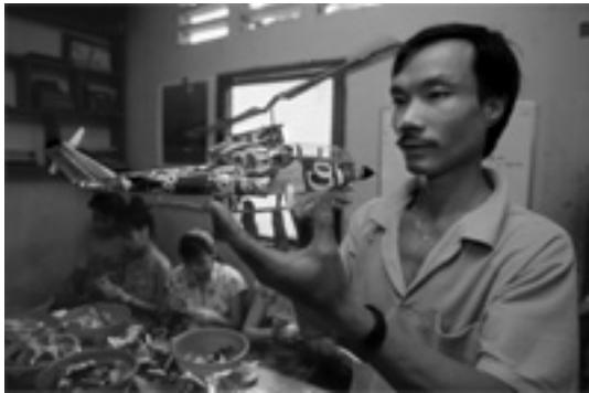
This man runs a small factory in Ho Chi Minh City that fabricates helicopters and fighter planes from discarded soft drink cans, with the Coca Cola helicopter being his best seller.