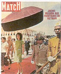
Above: children commemorating the war at a 1985 ceremony. Right: Xuan Loc, the site of the last battle of the Vietnam War, 1980. Left and below: Some of the publications Jones Griffiths shot for.