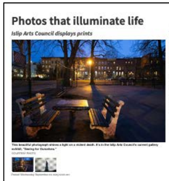
Islip Bulletin Coverage of September 2023 Exhibit Staged by Islip Arts Center in Bay Shore, NY

All royalties net of project expenses will be donated to the photographers and arts programming serving New Yorkers on probation.